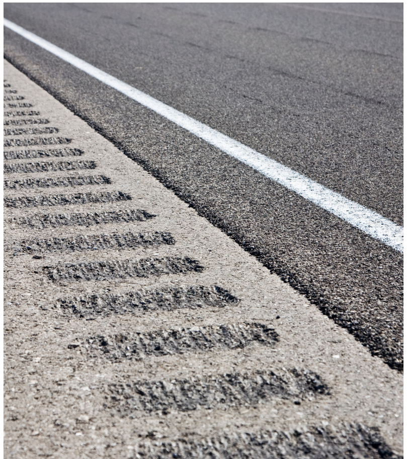
IMAGE ABOVE: Rumble Strips

RECOGNIZING LIFE- SAVING ENGINEERING SOLUTIONS THAT AGENCIES HAVE INTEGRATED INTO THEIR ROAD SAFETY PROGRAMS