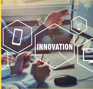
IMAGE ABOVE: Colleagues working at a computer