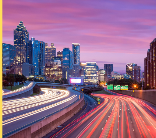
IMAGE ABOVE: Bright highway at sunset