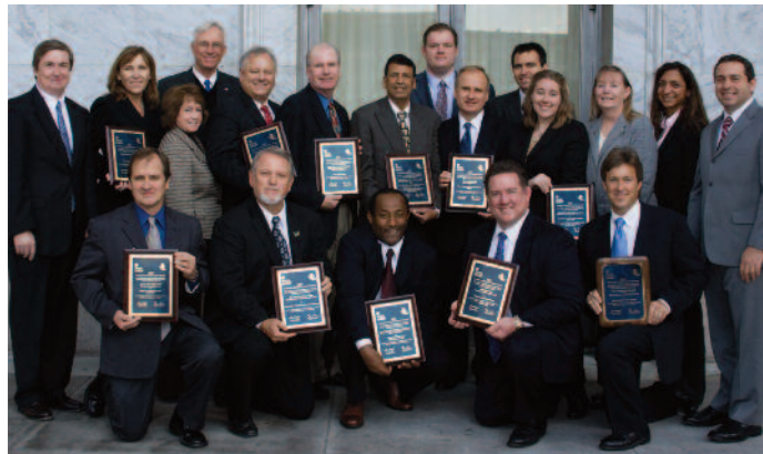
2009 National Roadway Safety Awards winners.