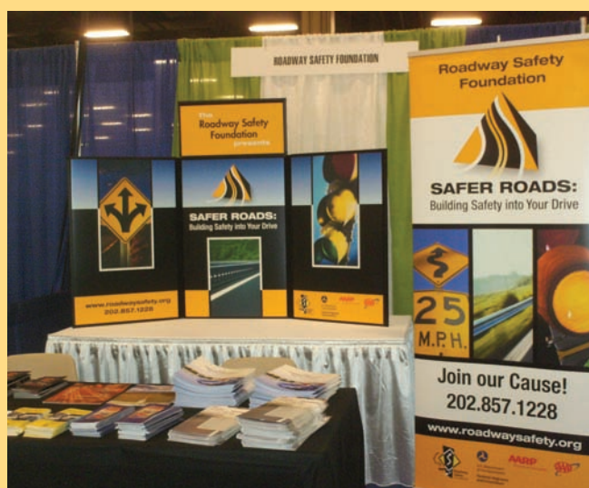
The Roadway Safety Foundation (RSF) showed off its new Safer Roads: Building Safety Into Your Drive Campaign booth at the Lifesavers Highway Safety Conference on March 29 – April 1 in Nashville, TN.