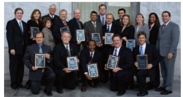
2009 National Roadway Safety Awards winners.

Winners receive an invitation to attend a national-level recognition event in Washington, DC in November. U.S. Transportation Secretary Ray